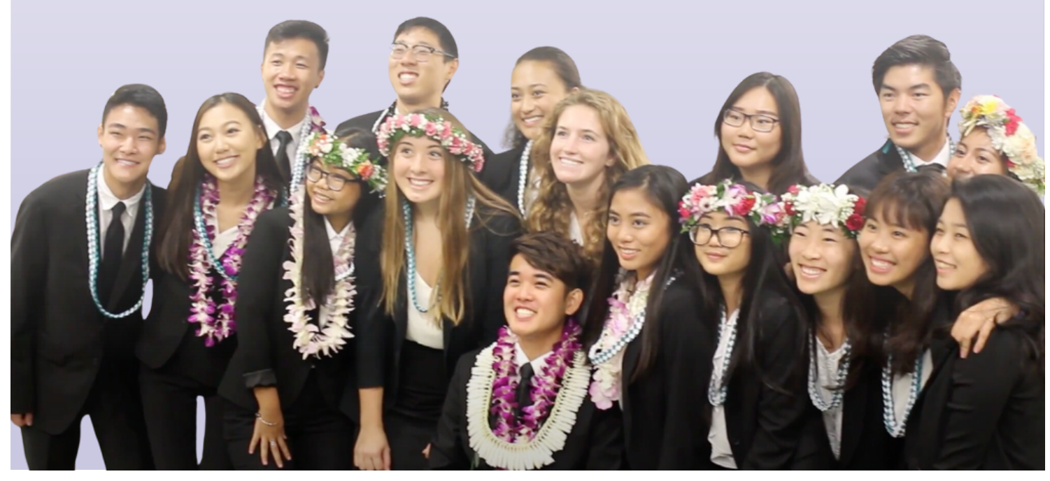
Delta Sigma Pi: Rho Chi Spring 2018 Initiation.